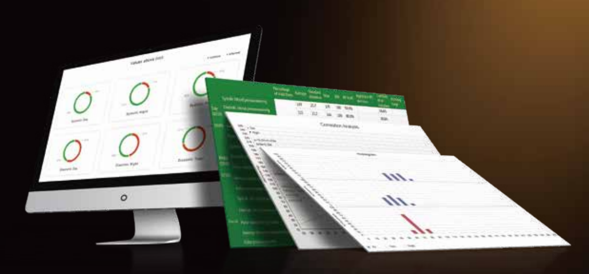
Pie Chart Analysis

With the aid of the SA-10's powerful analysis software, the clinicians can have a better insight into the variation of patient's blood pressure within 24 hours, easily identifying the periods when the blood pressure values are above limits. The informative statistical table provides a clear presentation of the measurement summary throughout the day.